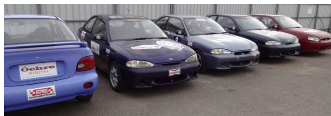
The end result